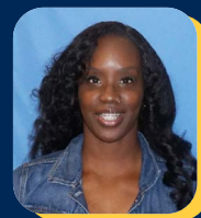
Ivermoner Fultz Relief Instructor ABS West