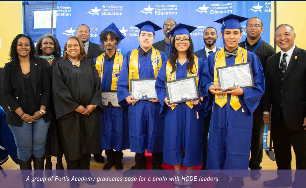
A group of Fortis Academy graduates pose for a photo with HCDE leaders.